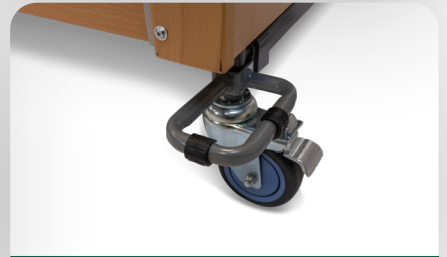
wall protection system