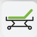
Back rest 0 – 70°

The Ecofit Xtra is a well thought out heavy-duty bed for home care. It has been specially designed for obese people, can support a maximum patient weight of 350 kg and is incredibly stable.