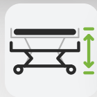
Height 270 – 695 mm