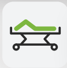
Leg rest 0 – 30°