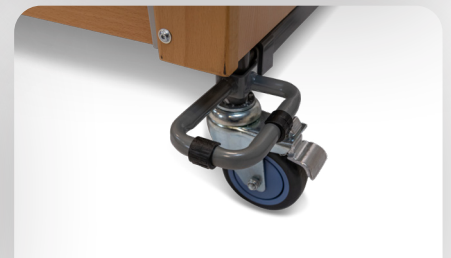
wall protection system