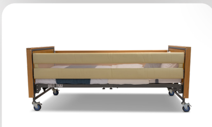
side rail protection