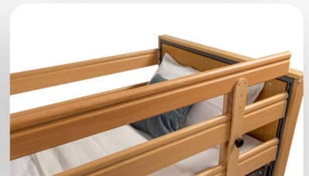
side rail elevation