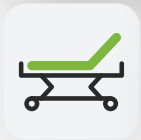
Back rest 0 – 70°

Besides its additional functionality, the care bed Ecofit S Comfort also features mattress compensation and Antitrendelenburg function, which makes everyday care easier for residents and carers.