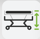
Height 220 – 645 mm