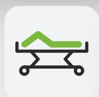
Leg rest 0 – 30°